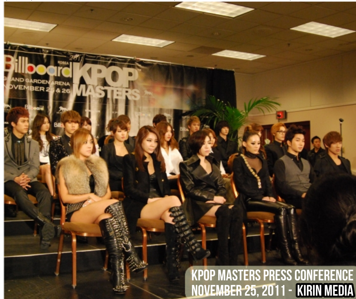
KPOP MASTERS PRESS CONFERENCE NOVEMBER 25, 2011 - KIRIN MEDIA