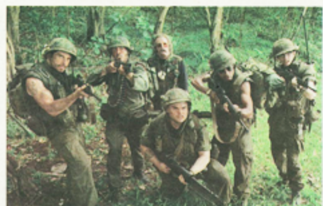
BEN STILLER, Jack Black, Nick Nolte and Robert Downey Jr. star in "Tropic Thunder"

"Tropic Thunder" first piqued my interest when I saw Ben Stiller, Jack Black, and an insanely wild-looking black guy with the name "Robert Downey Jr." above his head, plastered on the side of the Hotel Roosevelt in downtown LA. It was huge and impossible to miss. Besides wondering to myself "Why is Robert Downey Jr. black?" I also wondered if this would just be another in a long string of unfunny parodies with an epic tagline. "Come get some" is the tagline, and get some I did.