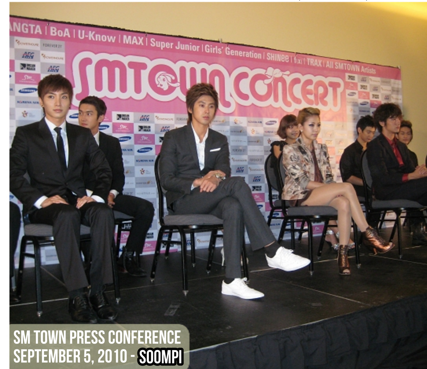
SM TOWN PRESS CONFERENCE SEPTMBER 5, 2010

MIYAVI (2008), S.K.I.N. (2007), SM TOWN (2010, 2012), STAND UP (F.T. ISLAND & CNBLUE - 2012), WONDER GIRLS FEAT 2PM (2009), YTF (2012)