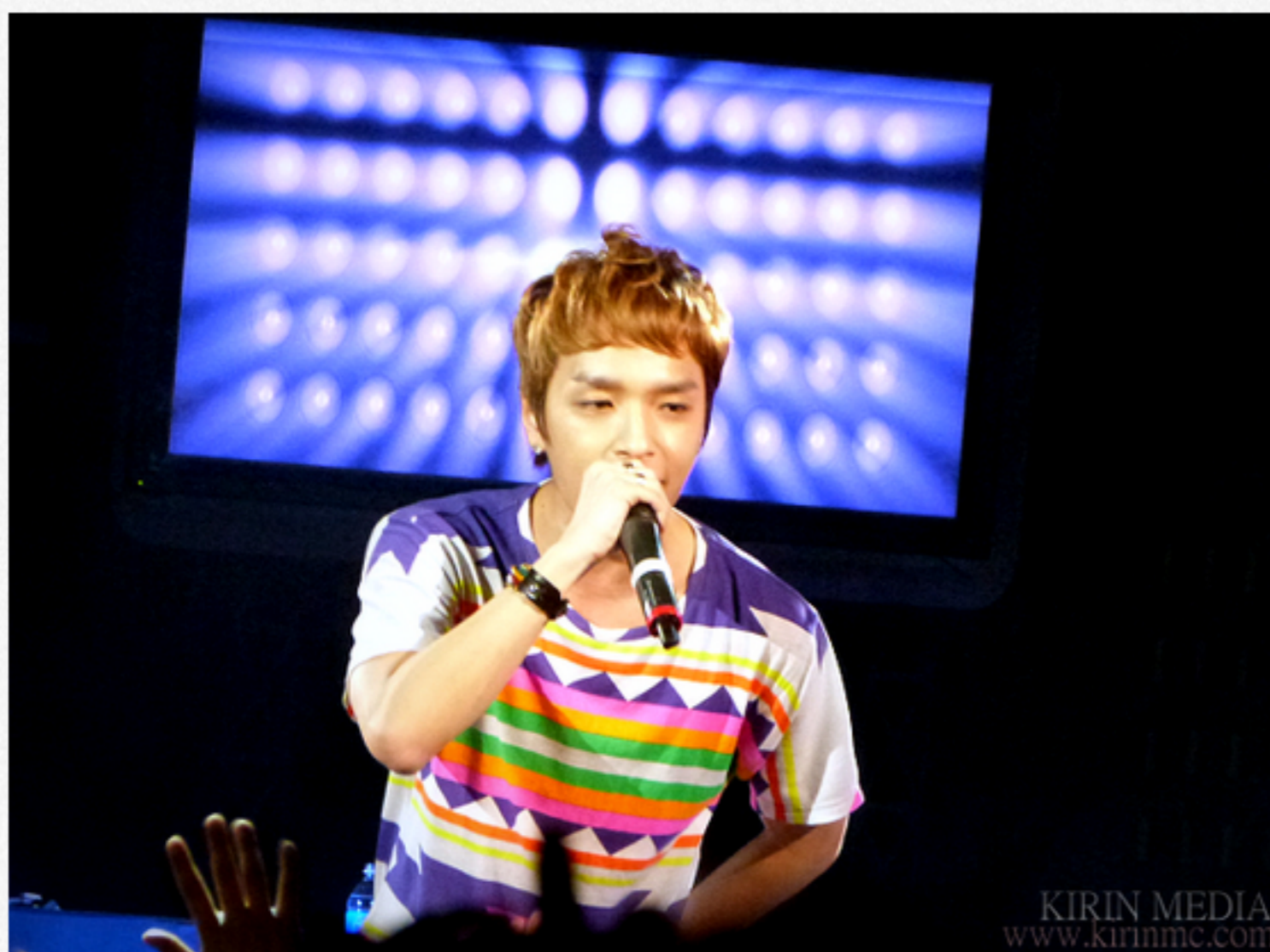
More photos in our gallery

Amoeba Culture night in LA. INCREDIBLE. Idols may control the industry but Korean hip hop is alive and kicking and if the long ass line was any indication, this is the music that is supported by Korea's college kids and twenty somethings. Amoeba Culture is Dynamic's Duo label. It's where they pour their artistic ideas into other artists. Supreme Team is one of them. Others include Primary and 공동CD.